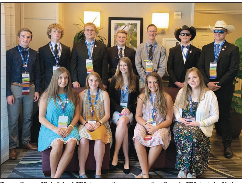
Towns County High School FBLA competitors representing Georgia FBLA at the National Leadership Conference in San Antonio, Texas.

academic careers. In addition to the competitions, students immersed themselves in contributions to FBLA! meetings, my favorite part an informative packed exhibit